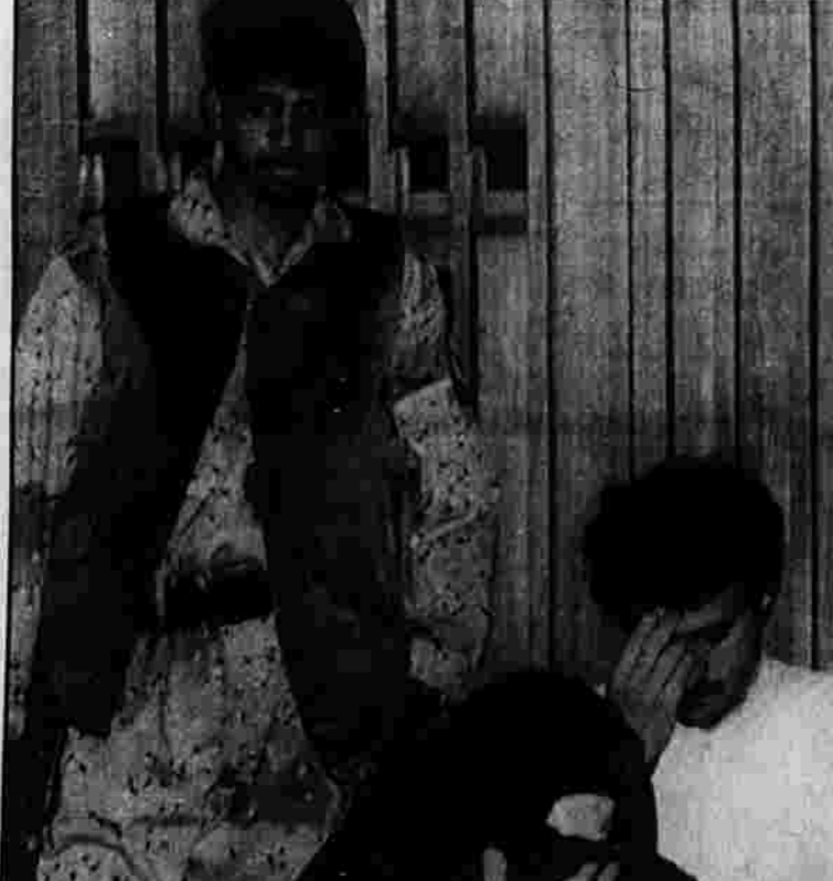
FETTERED PRESS — Defendants accused of collaborating with Iraqi occupation forces sit in the rear of a Kuwait courtroom Tuesday awaiting trial. The defendants are journalists who worked for the Iraqi newspaper Al-Nidas during the occupation.

SEASIDE CHAT — Vice President Dan Quayle is briefed by a Japanese naval officer aboard a minesweeper off Yokosuka, south of Tokyo. Quayle thanked Japanese officials for sending minesweepers to help with the war against Iraq.