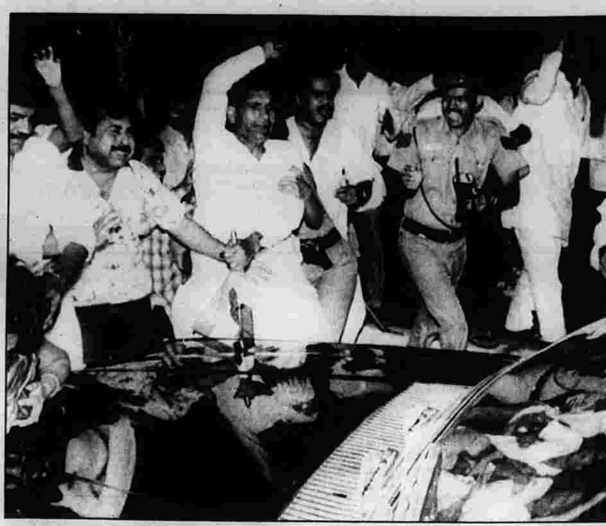
VIOLENT REACTION — An angry mob of Indians attack a presidential car passing outside the New Delhi residence of former Indian Prime Minister Rajiv Gandhi after news broke Tuesday night of his death in a bomb attack. Sporadic violence was reported around the nation.

deputy to Soviet Prime Minister Valentin Pavlov, and Gorbachev aide Vyegny Primakov plan to go to Washington next Monday to meet with President Bush's economic advisers. A team of Soviet economic experts already is in the United States consulting with American economists. Using emergency presidential powers, Gorbachev on Tuesday ordered officials to set a new budget for minimum wages and pensions based on the retail cost of a range of consumer items. The decree, announced on the nightly newscast "Vremya" and carried by the state news agency Tass, did not link income directly to prices — a practice called indexation and one blamed for fueling inflation in other countries. Once a year, starting July 1, officials will calculate how much an individual or family would have to pay for items ranging from furniture and clothing to medicine and transportation. Based on the result, the government will reckon changes in the standard of living and determine the minimum amount of wages, pensions, subsidies and social benefits generally. It also will determine the state expenses for food in hospitals, schools, dormitories, nursery schools and the like. That said, the consumer budget will create a uniform wage-setting formula. The formula — essential for determining wages and salaries — comes nearly two months after the government loosened prices on most consumer goods after nearly 30 years.