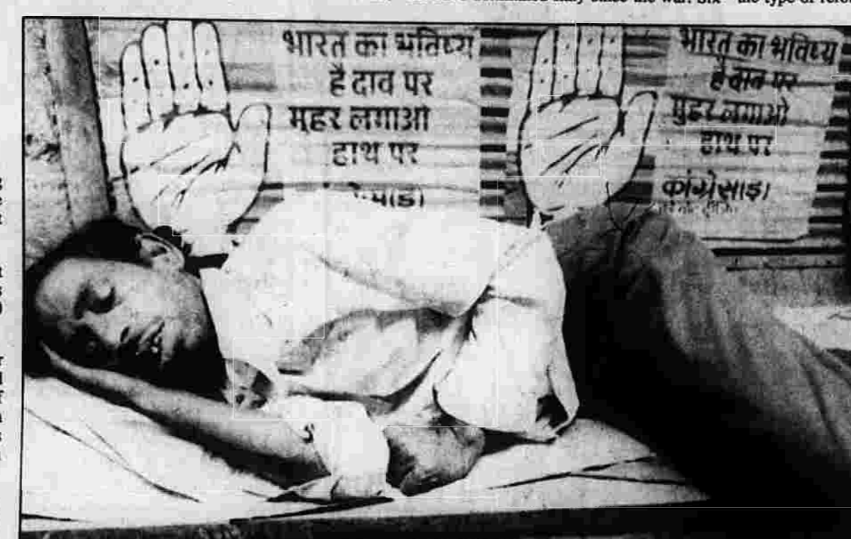
VOTING INVALIDATED — A man takes a nap in New Delhi Tuesday under election notices from Rajiv Gandhi's Congress Party. Monday's election was rocked with violence, leading to 55 deaths, and several incidents of fraud. Five district elections were overturned because of irregularities in the early stages of voting. Voting continues through Sunday.