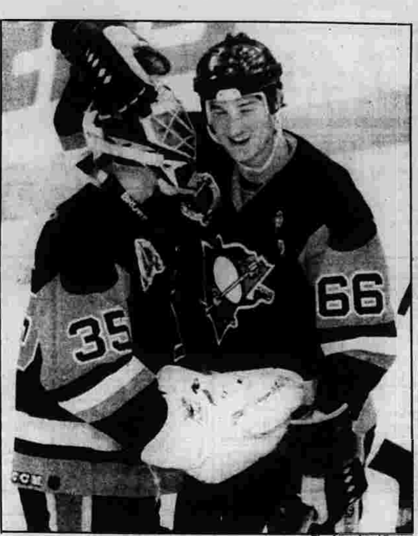
HAPPY PENGUINS — Mario Lemieux, right, and Tom Barraso of the Pittsburgh Penguins share a hug after Pittsburgh beat the Minnesota North Stars, 5-3, Tuesday night to even their Stanley Cup final series at 2-apiece.