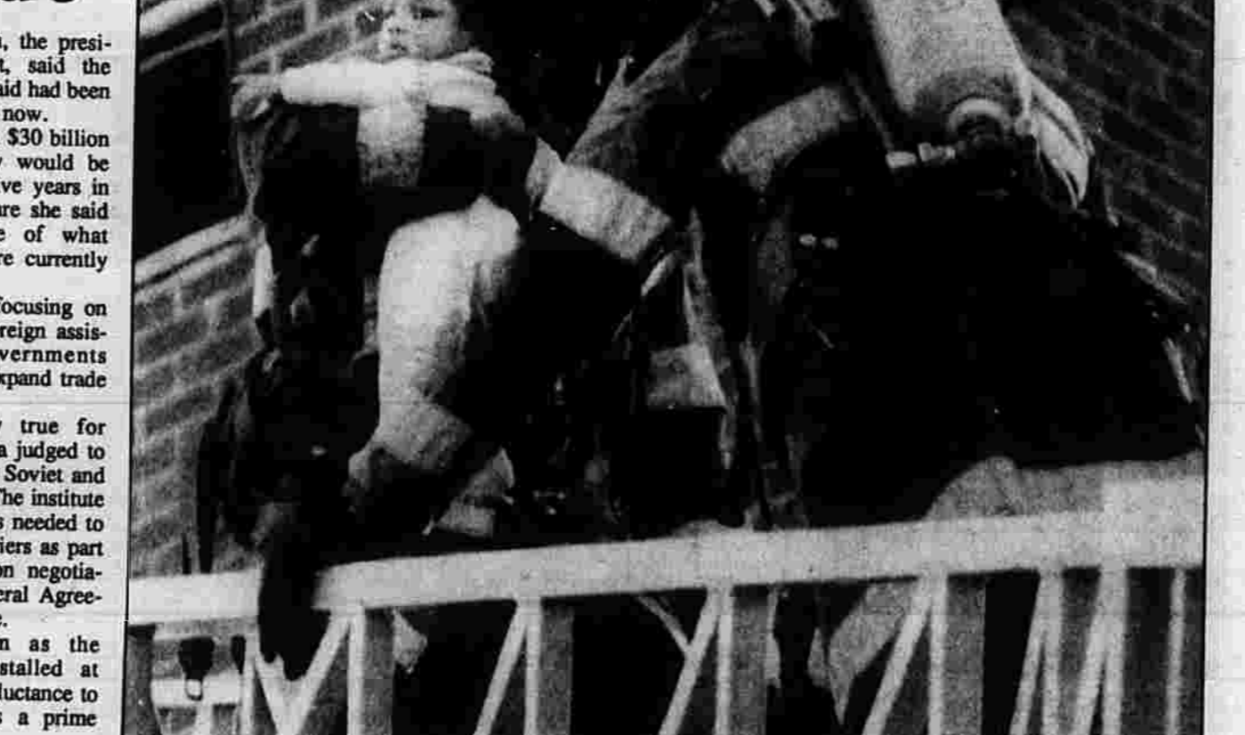
RESCUED — Firefighters carry an unidentified child down a ladder from the sixth floor of a burning building during a fire in Boston Tuesday evening. One firefighter and several occupants of the building were injured.