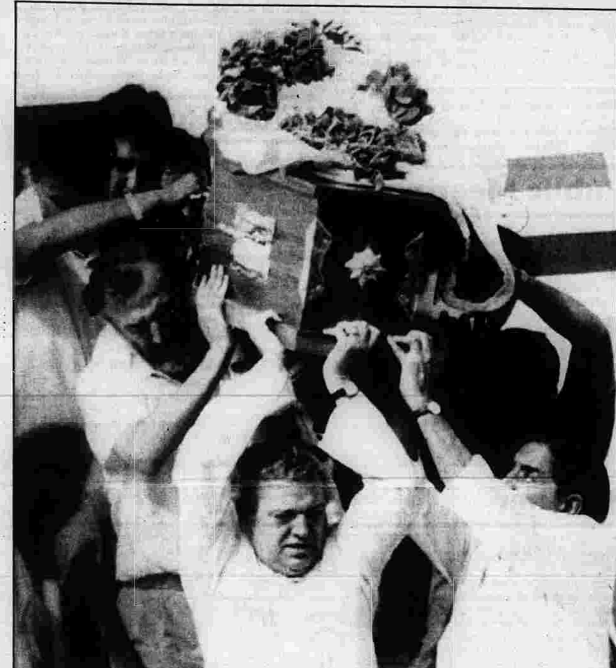
RETURN HOME — The coffin holding the body of former Prime Minister Rajiv Gandhi is carried down the steps of an Air Force Boeing 737 jet at New Delhi airport this morning. Gandhi was assassinated by a bomb at an election rally in South India Tuesday night.